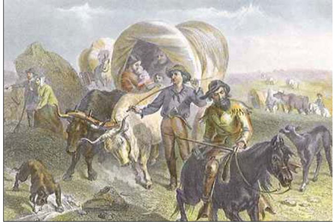
Pioneers settled Harney County during the 1860's as they traversed the land in covered wagons pulled by horses and oxen.

The history of Harney County dates from the early 1800's when the first white man appeared. These fur trappers and traders, among them Peter Skene Ogden, traveled Harney County around 1826. Wagon trains on their way to the Willamette Valley traversed the area during the 1840's and 50's, but most of the permanent settlers or homesteaders did not arrive until after 1860. Until that time, the Great Basin was the domain of the Paiute tribes, a sub tribe of the Shoshone.