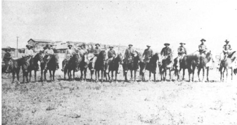
The cattle ranching industry in Harney County employed many buckaroos, as they would move the cattle to market and around the large rangeland areas.